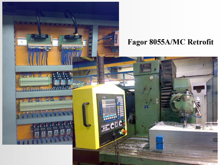
Fagor 8055A/MC Retrofit

New Control Systems simplify wiring, and enhance the features of the machine.