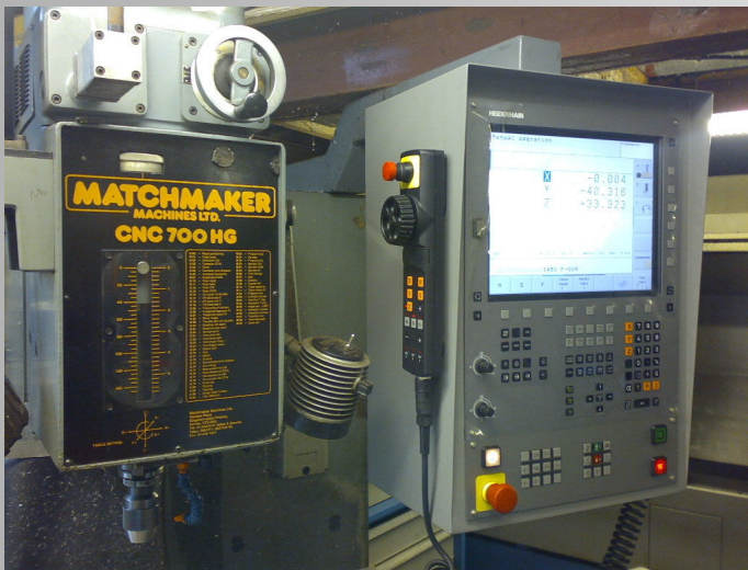
Matchmaker Machine Upgrade using the latest Heidenhain TNC 320 control